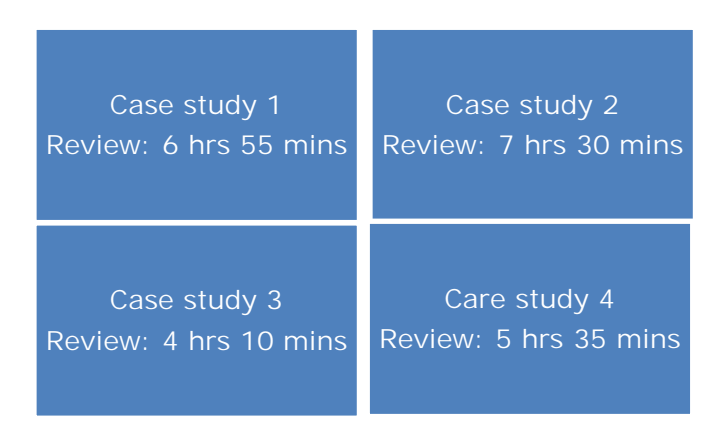
Figure 6: Time spent on reviews

The estimates provided by IROs show that differences between areas seem to be partly explained in terms of the amount of time spent on preparing for reviews: