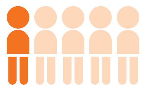
One in five young people live in fuel poverty<sup>2</sup>

Approximately 40 per cent of households living in cold homes are couples or lone parents with dependent children, and a quarter of households headed by 16 to 24-year-olds live in fuel poverty4. In total, 3.8 million children in England live in families that are struggling to pay their energy bills.5