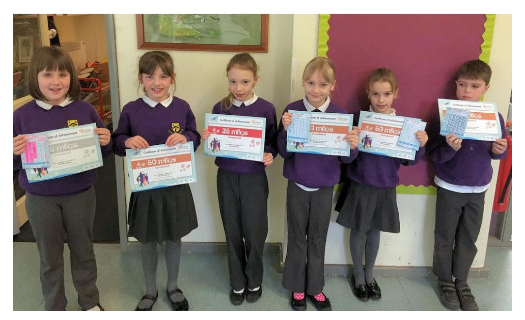
Pupils at Braithwaite School with certificates awarded to them in an assembly

The challenge encourages participating schools to get all of their pupils to complete and record 100 miles of physical activity during the academic year. Miles can be logged both within and outside the school day, through walking, running, cycling, swimming and other means. Like the Daily Mile, the 100 Mile Challenge is a universal intervention that is designed to be fully inclusive. The programme's impact is measured through pupil surveys and a simple online mechanism for collecting data from schools.