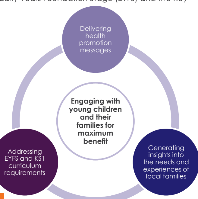
Figure 1: Engaging with young children and their families for maximum benefit

Consider the example below alongside the example on the following page, of engaging with young children and their families around a local Childhood Obesity Strategy. Together they show how the benefits of engagement can be maximised for children, families, agencies and organisations through collaboration between decisionmakers, health providers and early years settings and schools.